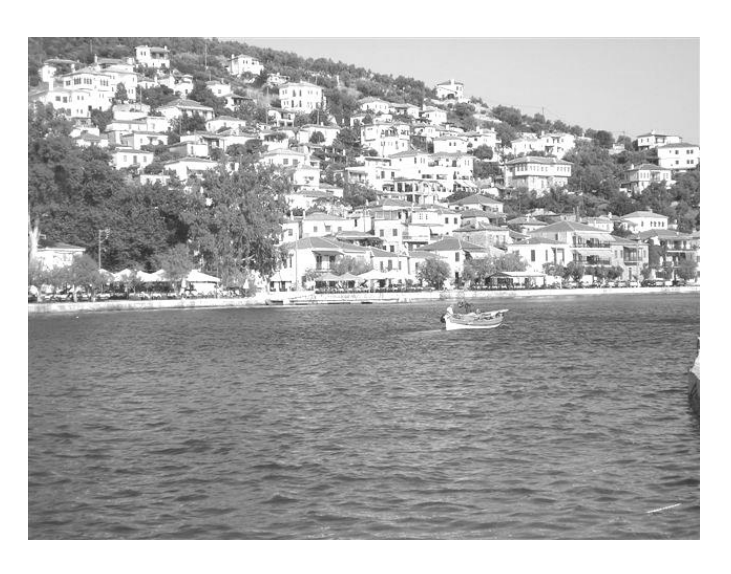
Afissos, a view of the village

We have described two walks up to the village of Afetes, about 230 metres (700ft) altitude above Afissos. The short walk (1) which is mainly on a quiet tarmac surfaced road takes about 50 minutes. The longer walk (2) is mostly through woodland and olive grove, although there is a section on a quiet road towards the end of the route, and takes about 1hr 20 minutes. The starting point for both walks is the square in Afissos. If you make a round-trip, combining walks 1 and 2, remember that we have described both from Afissos, so you will have to look for landmarks in reverse order on one leg of the journey. If you do make a round-trip, we suggest the woodland walk up (2) and shorter walk down (1).